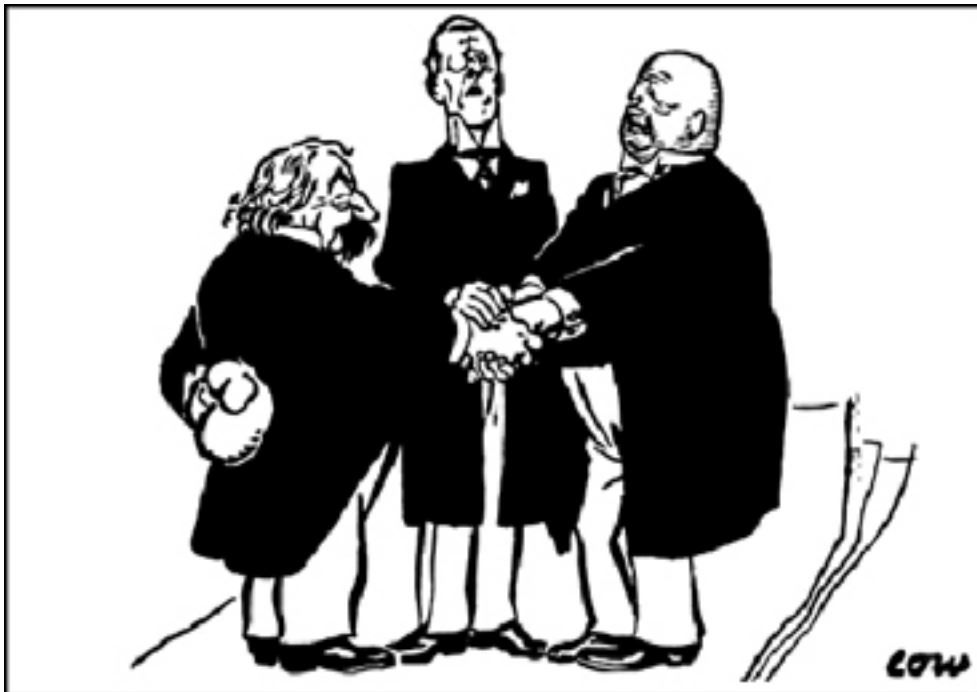
Briand Chamberlain Stresemann

A cartoon by David Low depicting Aristide Briand, Austen Chamberlain and Gustav Stresemann, taken from the London Evening Standard, 8 September 1925. France wanted to strengthen the League of Nations' covenant by a protocol engaging all members to the help of any member attacked. Taken from Europe Since Versailles , by David Low, London, 1940.