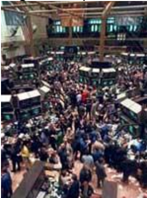
The trading floor of the NYSE

The most prestigious exchange in the world is the New York Stock Exchange (NYSE). The "Big Board" was founded over 200 years ago in 1792 with the signing of the Buttonwood Agreement by 24 New York City stockbrokers and merchants. Currently the NYSE, with stocks like General Electric, McDonald's, Citigroup, Coca-Cola, Gillette and Wal-mart, is the market of choice for the largest companies in America.