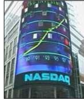
The Nasdaq market site in Times Square

On the Nasdaq brokerages act as market makers for various stocks. A market maker provides continuous bid and ask prices within a prescribed percentage spread for shares for which they are designated to make a market. They may match up buyers and sellers directly but usually they will maintain an inventory of shares to meet demands of investors.