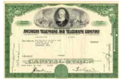
Example stock certificate (Click to enlarge)

A stock is represented by a stock certificate. This is a fancy piece of paper that is proof of your ownership. In today's computer age, you won't actually get to see this document because your brokerage keeps these records electronically, which is also known as holding shares " in street name ". This is done to make the shares easier to trade. In the past, when a person wanted to sell his or her shares, that person physically took the certificates down to the brokerage. Now, trading with a click of the mouse or a phone call makes life easier for everybody.